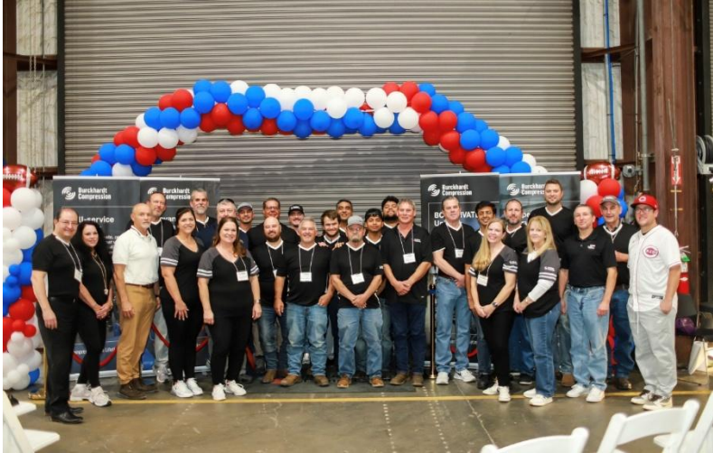
Image 1: Customers were able to meet up at the service center and take a tour to see the facilities for themselves as well as meet with field service personnel.